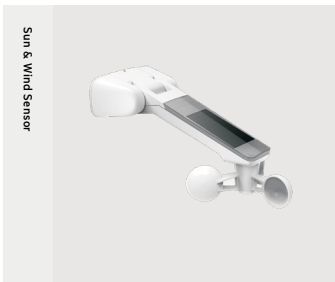
Sun & Wind Sensor