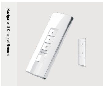
Navigator 5 Channel Remote