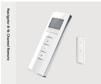
Navigator 8-16 Channel Remote