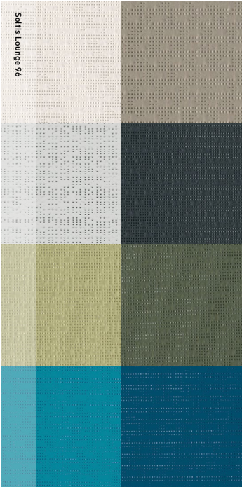
Soltis Lounge 96 is an optimised screen fabric that creates a comfortable ambience for outdoor living spaces. Designed and manufactured in France by Serge Ferrari, Soltis Lounge 96 is lightweight, durable and 100% recyclable. Available in 21 colours.