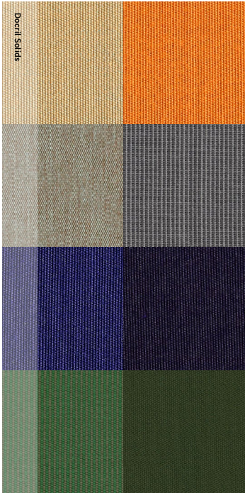
Docril offers an impressive selection of 80 vibrant colours to suit any décor and comes with a 10 year UV warranty.