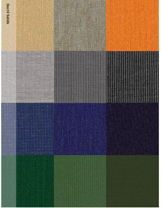
Docril acrylic canvas is designed and manufactured in Spain and known for its superb quality and extensive colour palette.

Docril offers an impressive selection of vibrant colours to suit any décor and comes with a 10 year UV warranty.