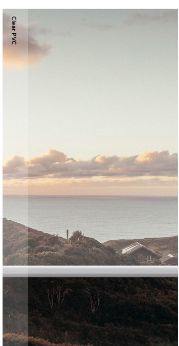
Designed for the New Zealand climate, dimensionally stable PVC is the best soltution when an unobstructed view is required, while providing full wind and rain protection.